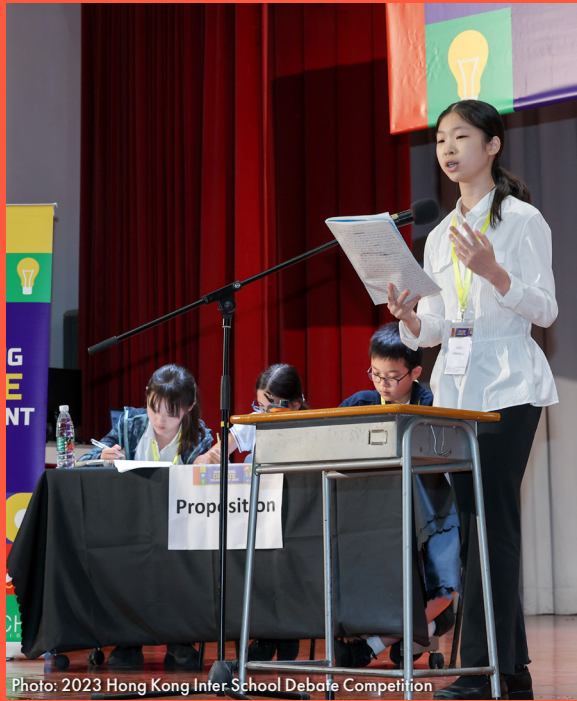
Photo: 2023 Hong Kong Inter-School Debate Competition