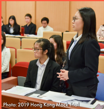
Photo: 2019 Hong Kong Mock Trial