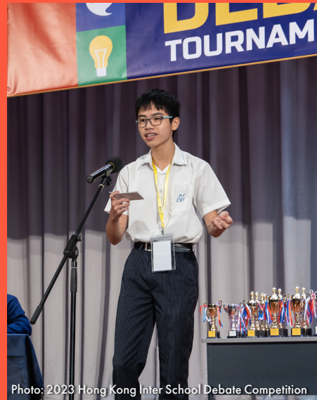
Photo: 2023 Hong Kong Inter School Debate Competition